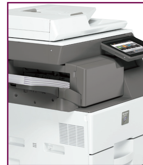
Optional inner finisher.