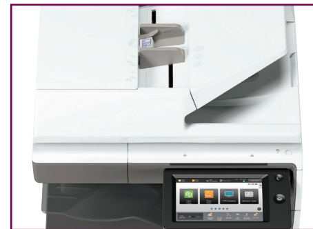
Scan ID and Business Cards.