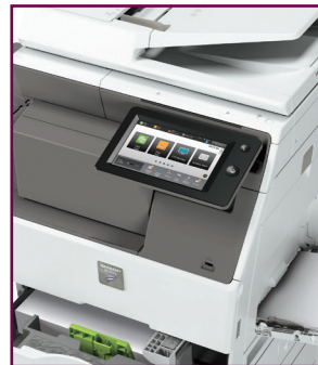
Expandable paper capacity.