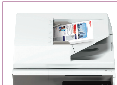
100-sheet Duplex Single Pass Feeder.

The MX-B455W offers 100-sheet Duplex Single Pass Feeder, while a 50-sheet Reversing Single Pass Feeder is available with the MX-B335W; both are perfect for environments such as reception areas where scanning needs to be done without delay.