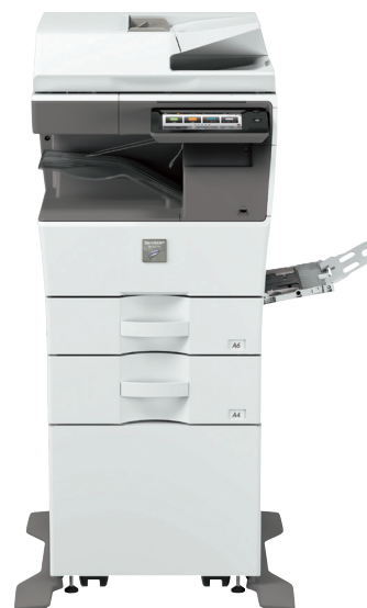
Expandable paper capacity configuration