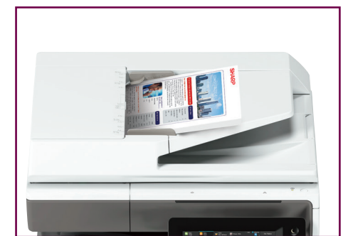
50-sheet Reversing Single Pass Feeder.