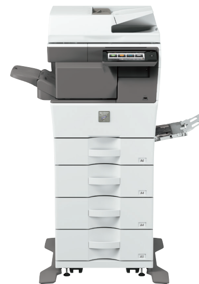
Fully configured with optimal finishing capabilities