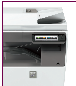
Compact, desktop configuration.